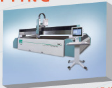
FLOW WMC®2 - WATERJET