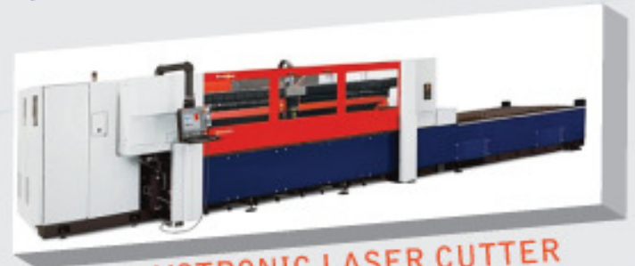
BYSTRONIC LASER CUTTER